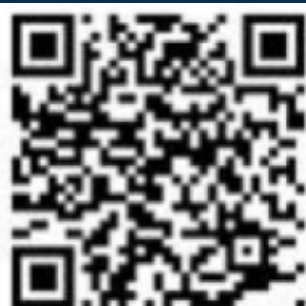
School Colours Direct