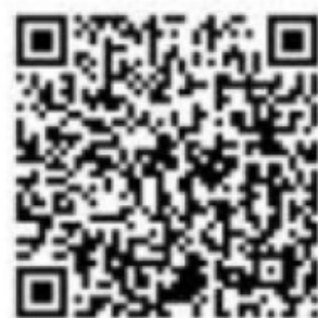
Whitby School Website

On the Prospect Hill (Upper) site, in the Sports Hall, 1.00-5.00pm